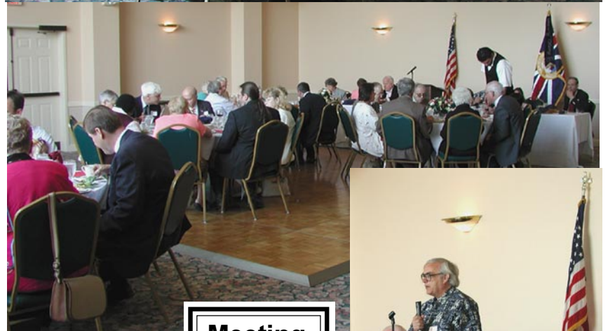
Page 3